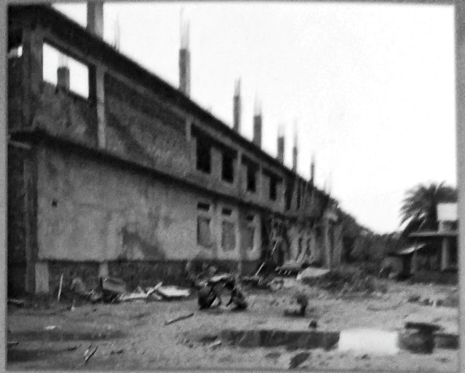
Upgradation of Library