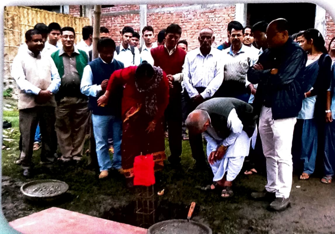
Laying Foundation of New Construction