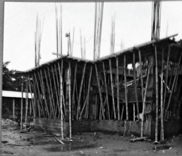
Construction of New Building