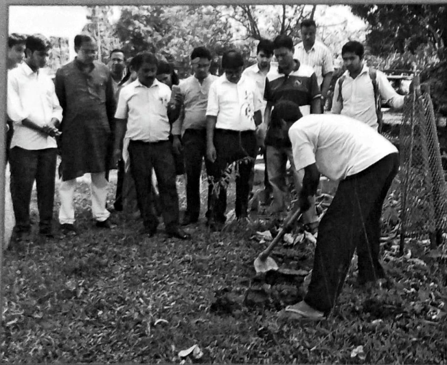
Celebration of World Environment Day