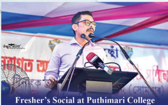
Fresher's Social at Puthimari College