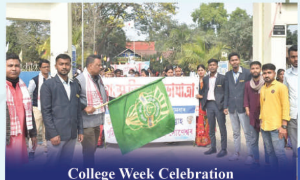
College Week Celebration