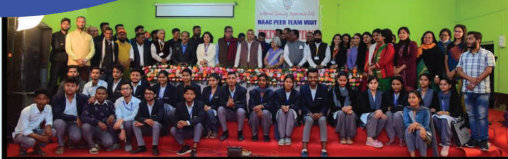
NAAC PEER TEAM VISIT, 2023