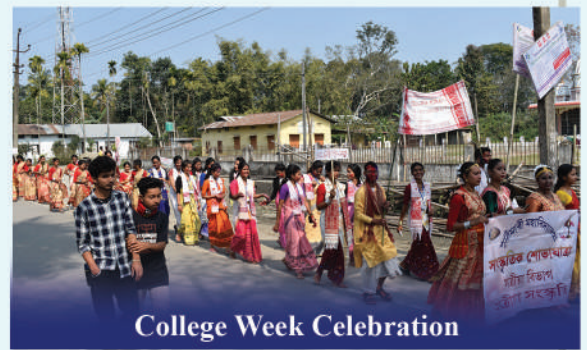
College Week Celebration