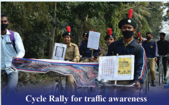
Cycle Rally for traffic awareness